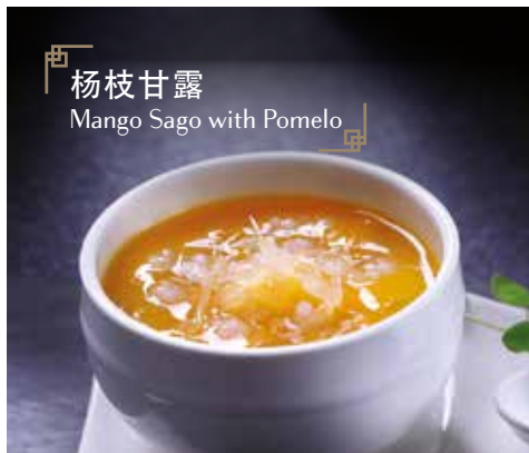
杨枝甘露 Mango Sago with Pomelo