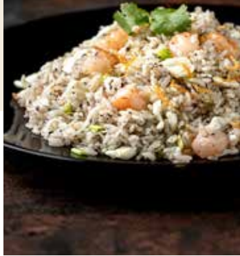
黑松露海鲜炒饭 Fried Rice with Seafood in Black Truffle Oil