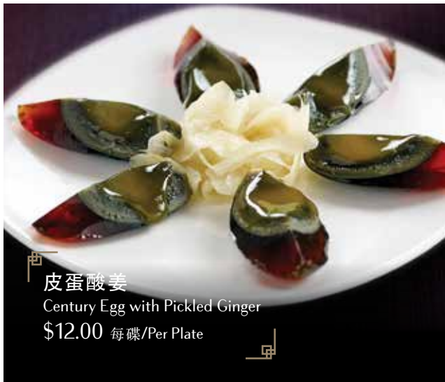
皮蛋酸姜 Century Egg with Pickled Ginger $12.00 每碟/Per Plate