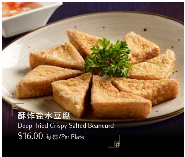
酥炸盐水豆腐 Deep-fried Crispy Salted Beancurd $16.00 每碟/Per Plate