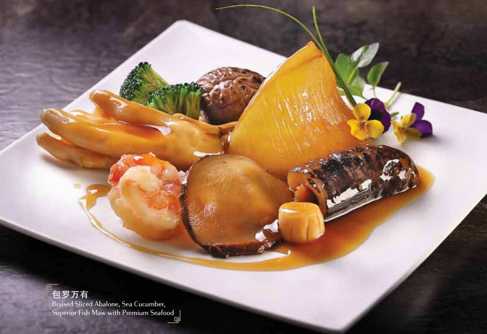
商 包罗万有 Braised Sliced Abalone, Sea Cucumber, Superior Fish Maw with Premium Seafood 肆