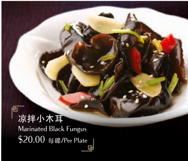
凉拌小木耳 Marinated Black Fungus $20.00 每碟/Per Plate