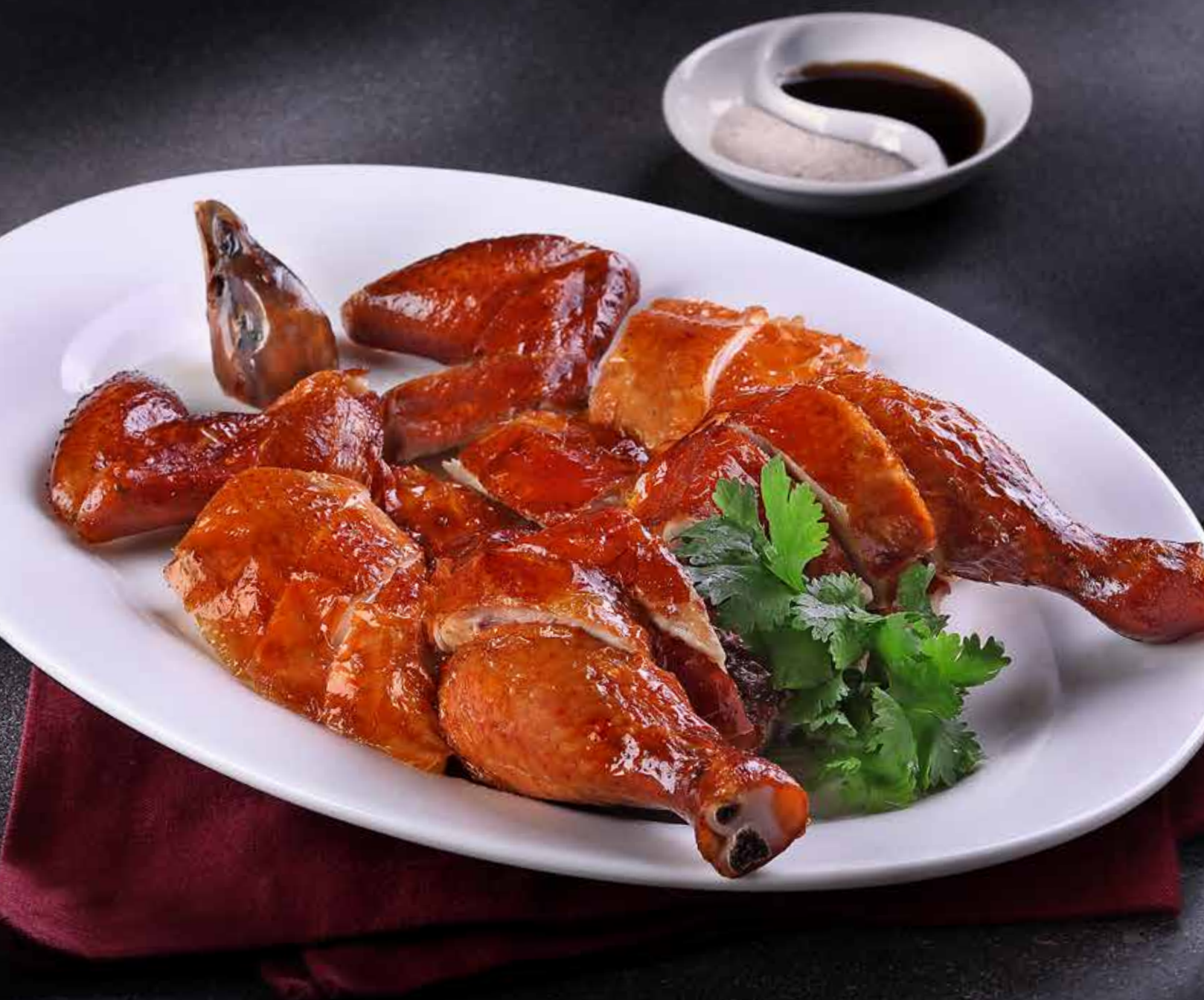
脆皮炸子鸡 Roasted Crispy Chicken