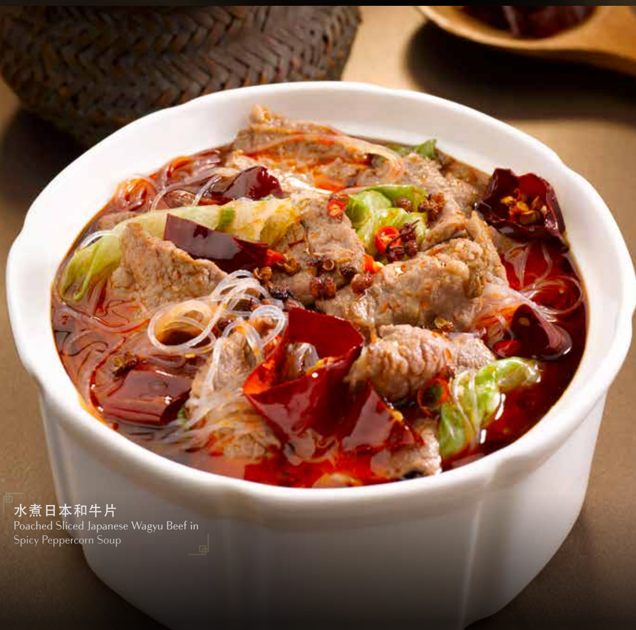
水煮日本和牛片 Poached Sliced Japanese Wagyu Beef in Spicy Peppercorn Soup