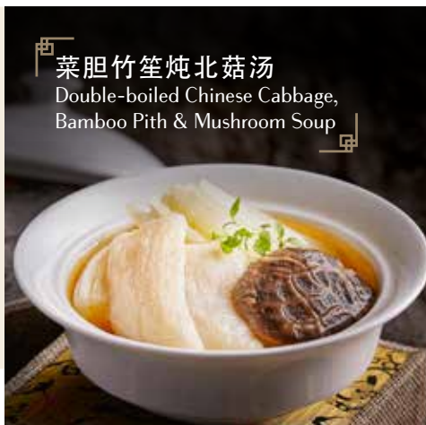
菜胆竹笙炖北菇汤 Double-boiled Chinese Cabbage, Bamboo Pith & Mushroom Soup