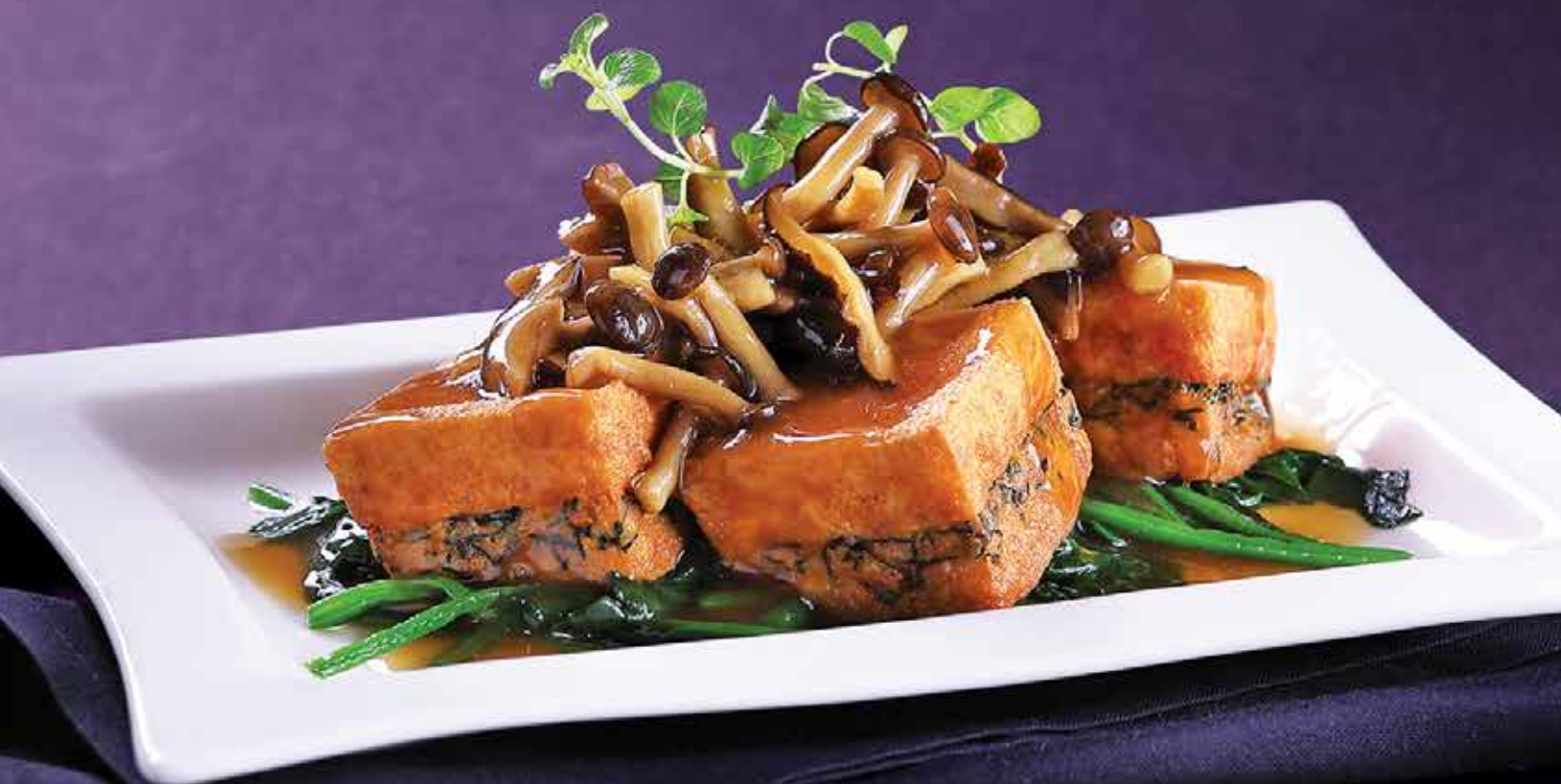
三菇扒菠菜豆腐 Braised Spinach Beancurd with Assorted Mushrooms