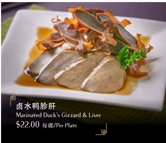
卤水鸭胗肝 Marinated Duck's Gizzard & Liver $22.00 每碟/Per Plate