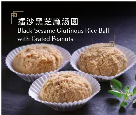
擂沙黑芝麻汤圆 Black Sesame Glutinous Rice Ball with Grated Peanuts