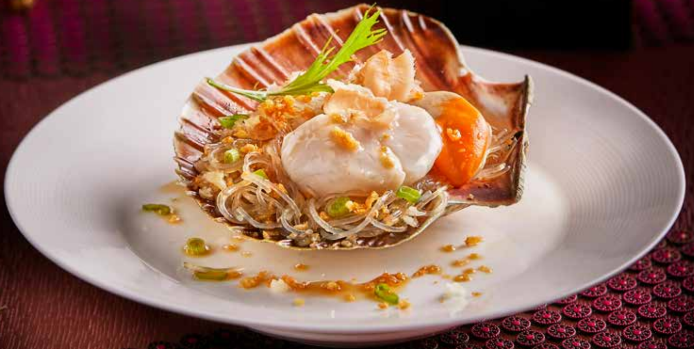
西 苏格兰扇贝 Scottish Fresh Scallop (金银蒜粉丝蒸 Steamed with Fried Garlic & Vermicelli)