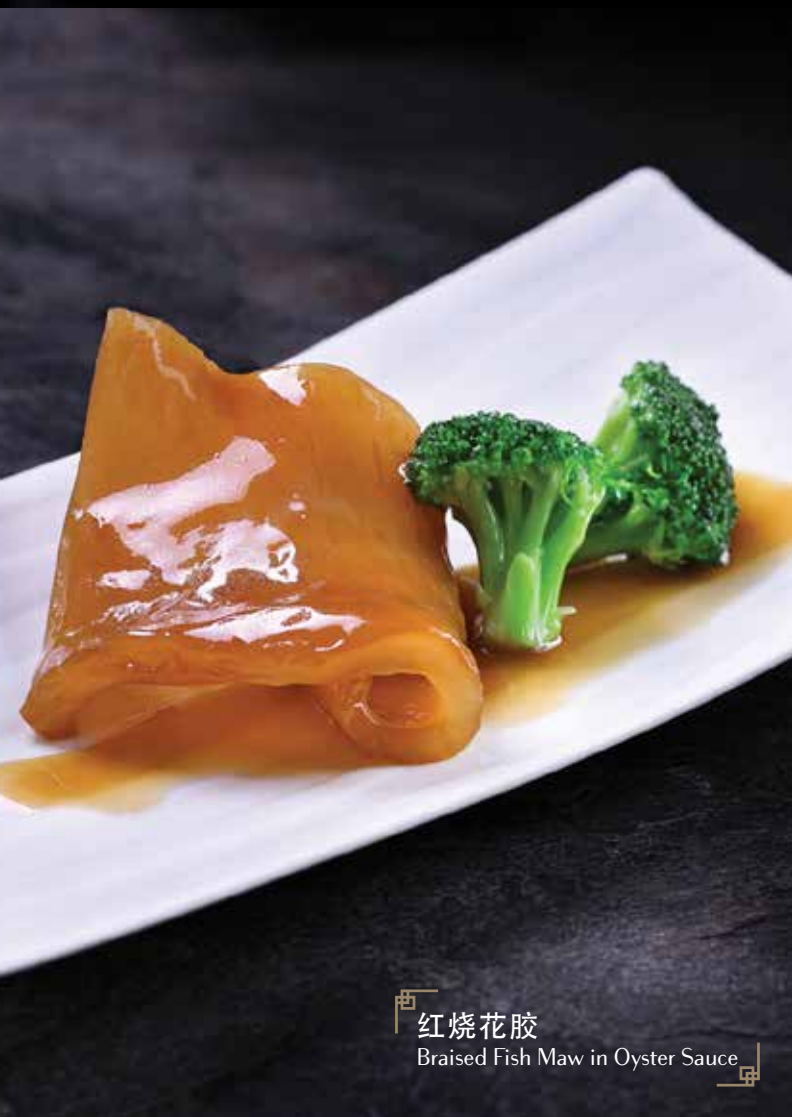
红烧花胶 Braised Fish Maw in Oyster Sauce