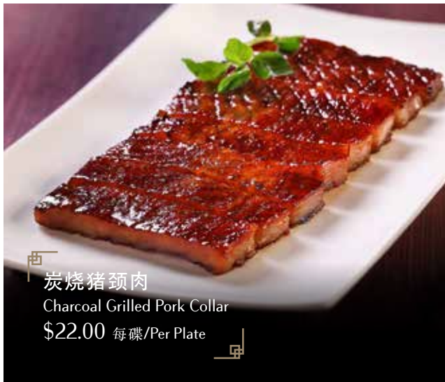
炭烧猪颈肉 Charcoal Grilled Pork Collar $22.00 每碟/Per Plate