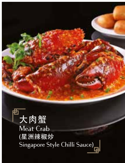
大肉蟹 Meat Crab (星洲辣椒炒 Singapore Style Chilli Sauce)