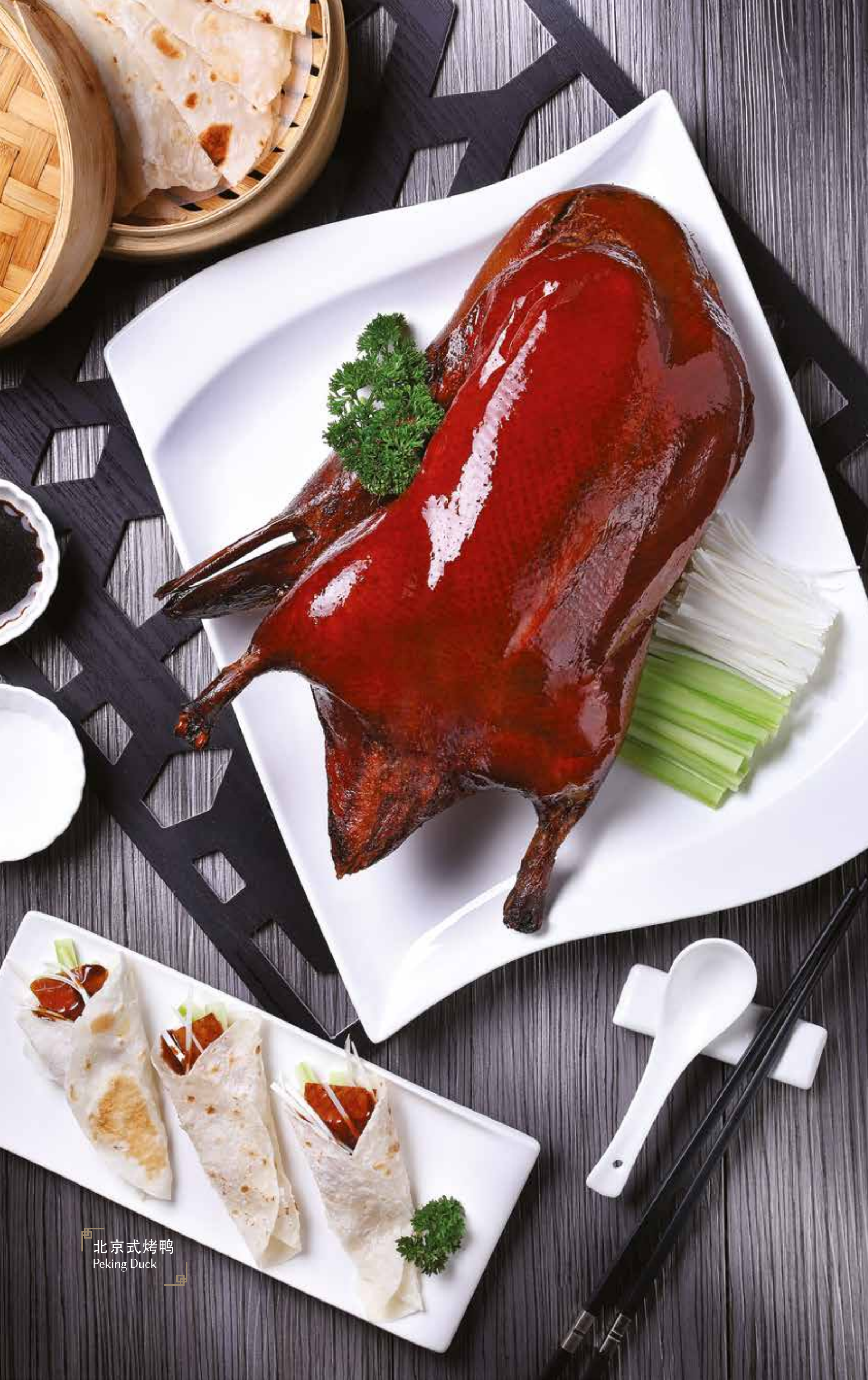
北京式烤鸭 Peking Duck