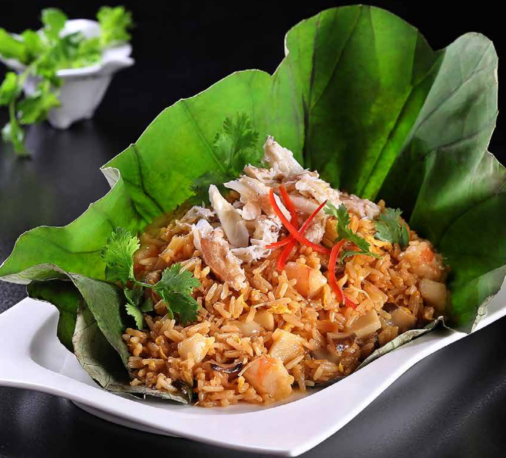
鮑汁海鮮荷葉飯 Steamed Diced Seafood Rice Wrapped in Lotus Leaf