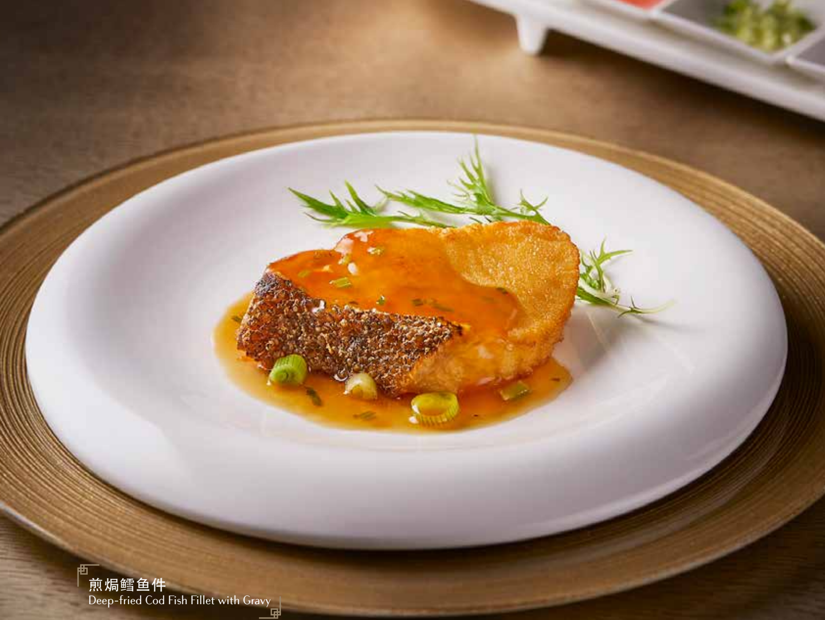
煎焗鱈鱼件 Deep-fried Cod Fish Fillet with Gravy