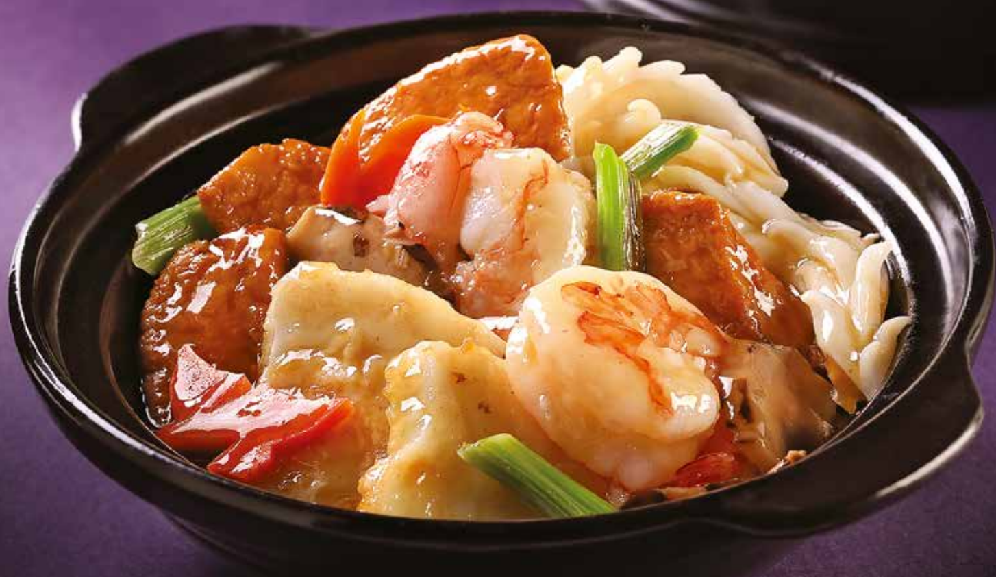
海鮮豆腐煲 Stewed Beancurd with Seafood in Claypot