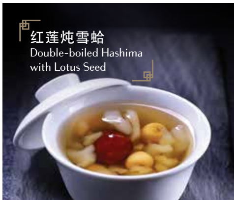
红莲炖雪蛤 Double-boiled Hashima with Lotus Seed