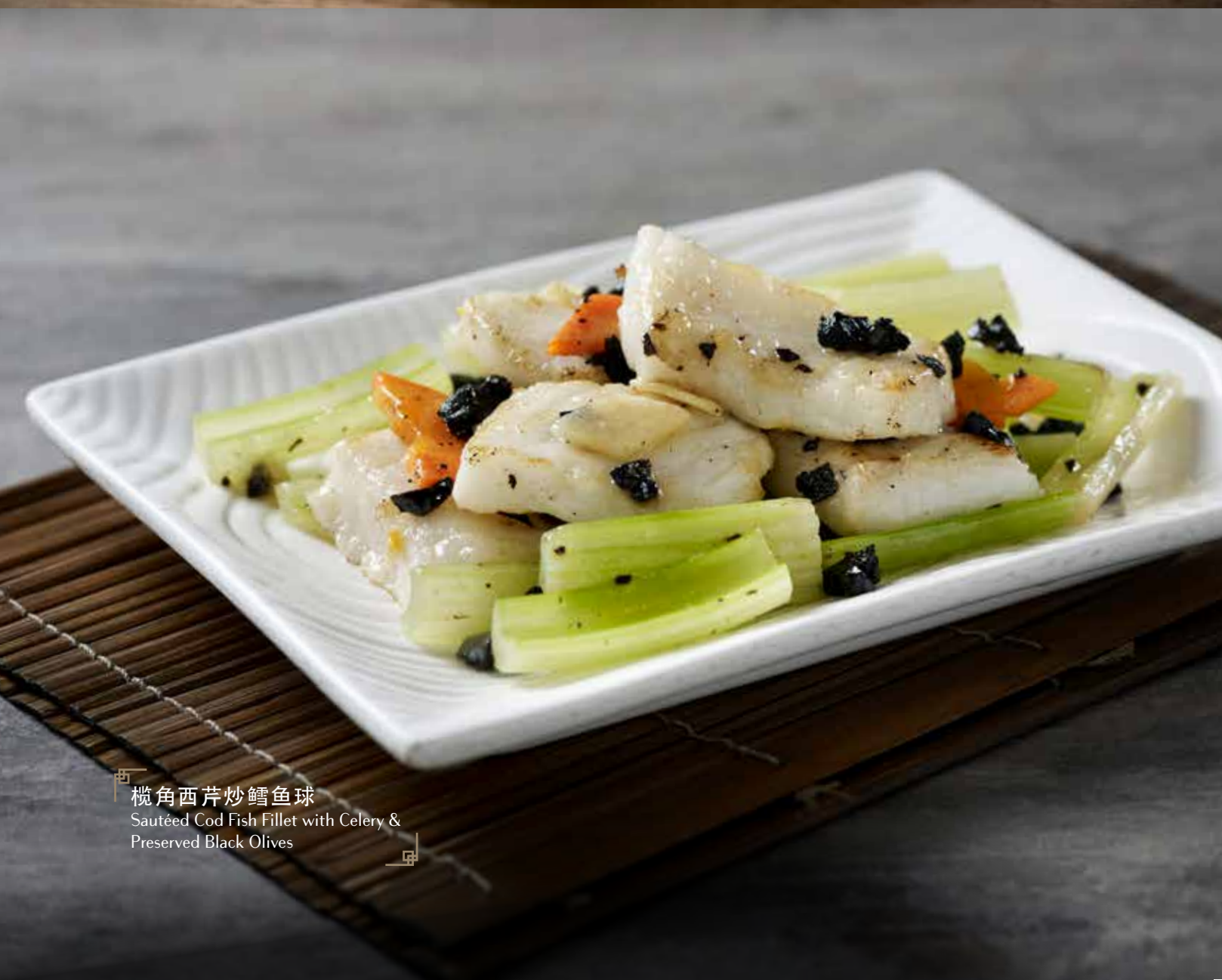
榄角西芹炒鱈鱼球 Sautéed Cod Fish Fillet with Celery & Preserved Black Olives