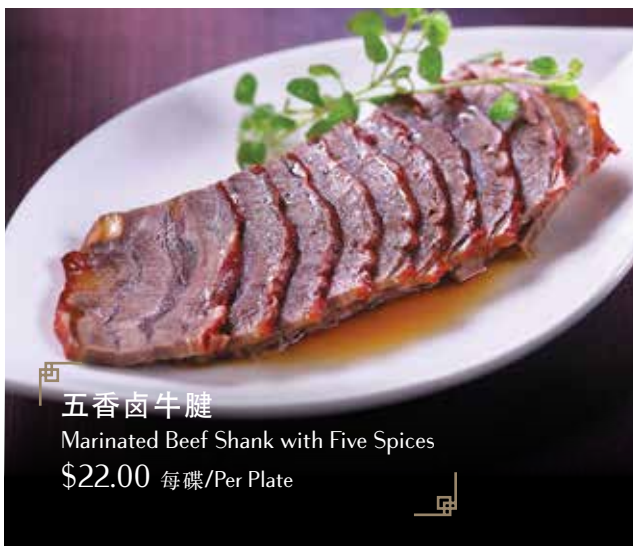
五香卤牛腱 Marinated Beef Shank with Five Spices $22.00 每碟/Per Plate