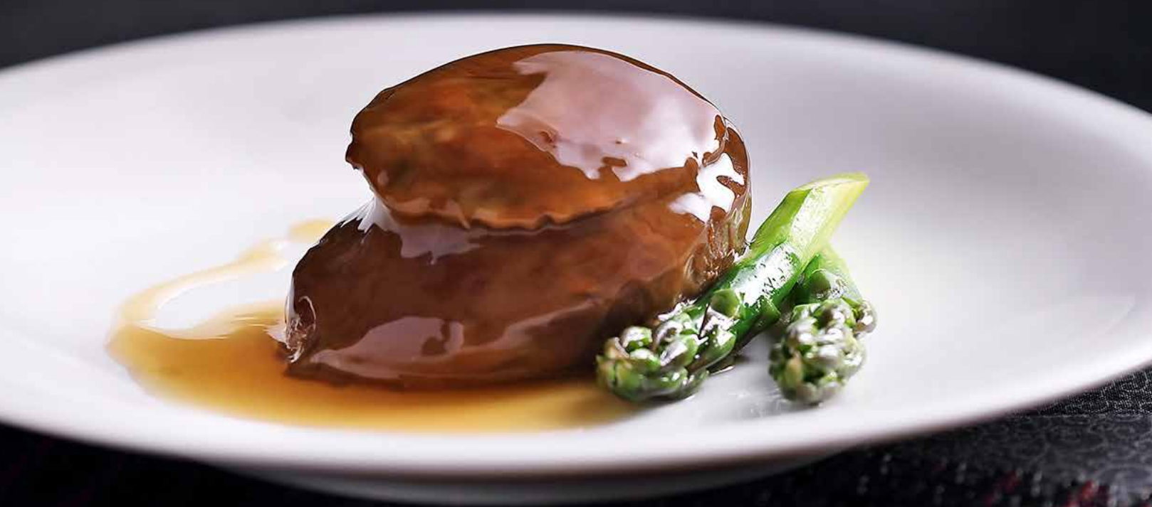
商 红烧原只澳洲鲜鲍鱼 Braised Australian Fresh Whole Abalone in Oyster Sauce 肆