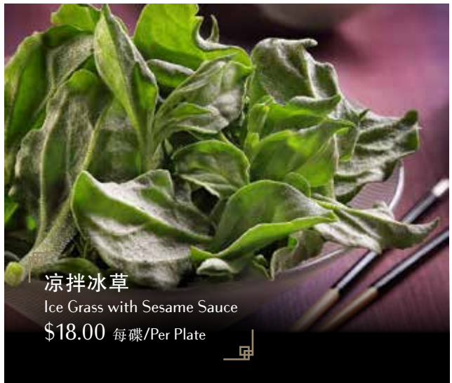
凉拌冰草 Ice Grass with Sesame Sauce $18.00 每碟/Per Plate