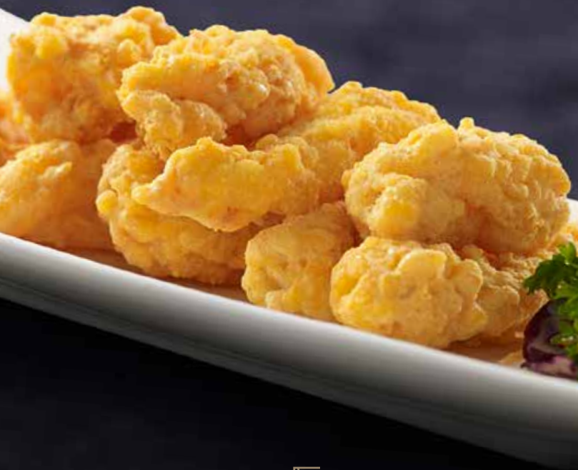
黄金焗鲜鱿 Baked Squid with Salted Egg Yolk