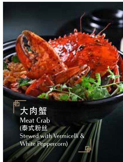
大肉蟹 Meat Crab (泰式粉丝 Stewed with Vermicelli & White Peppercorn)