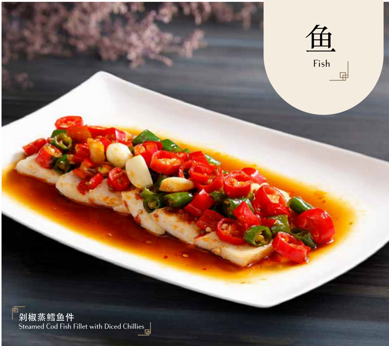
剝椒蒸鱈鱼件 Steamed Cod Fish Fillet with Diced Chillies