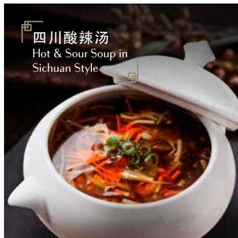
四川酸辣汤 Hot & Sour Soup in Sichuan Style