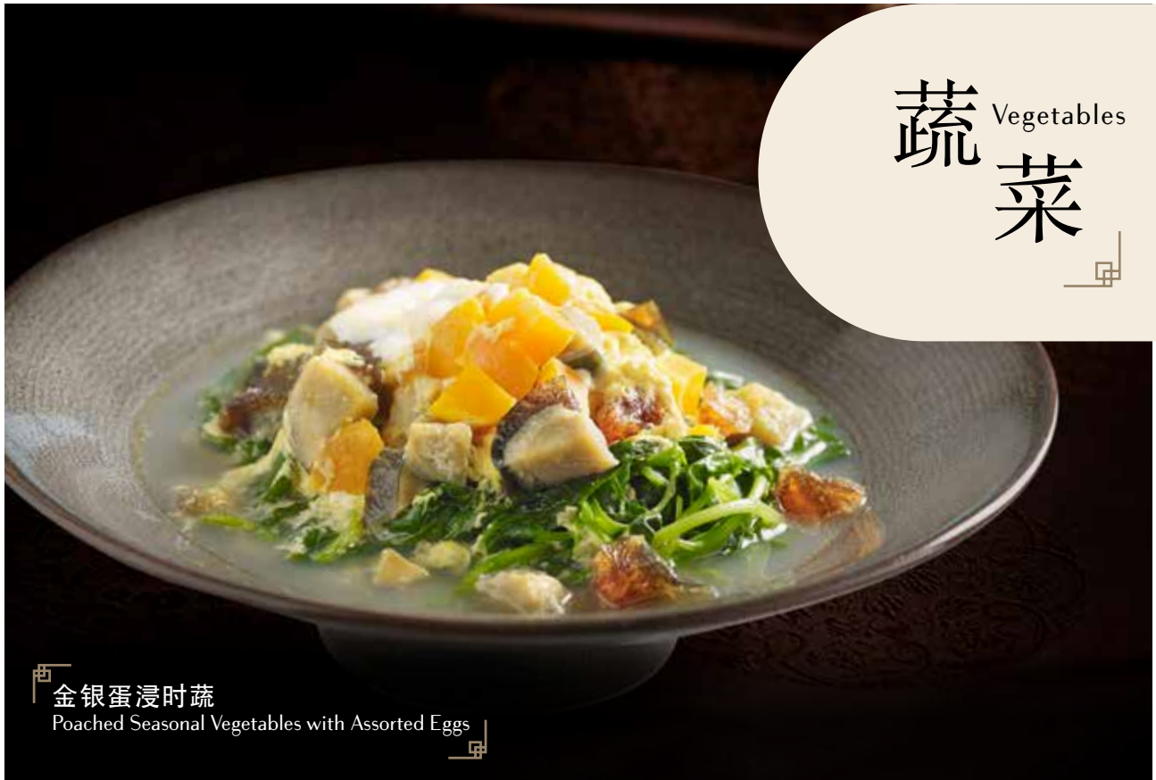
金银蛋浸时蔬 Poached Seasonal Vegetables with Assorted Eggs