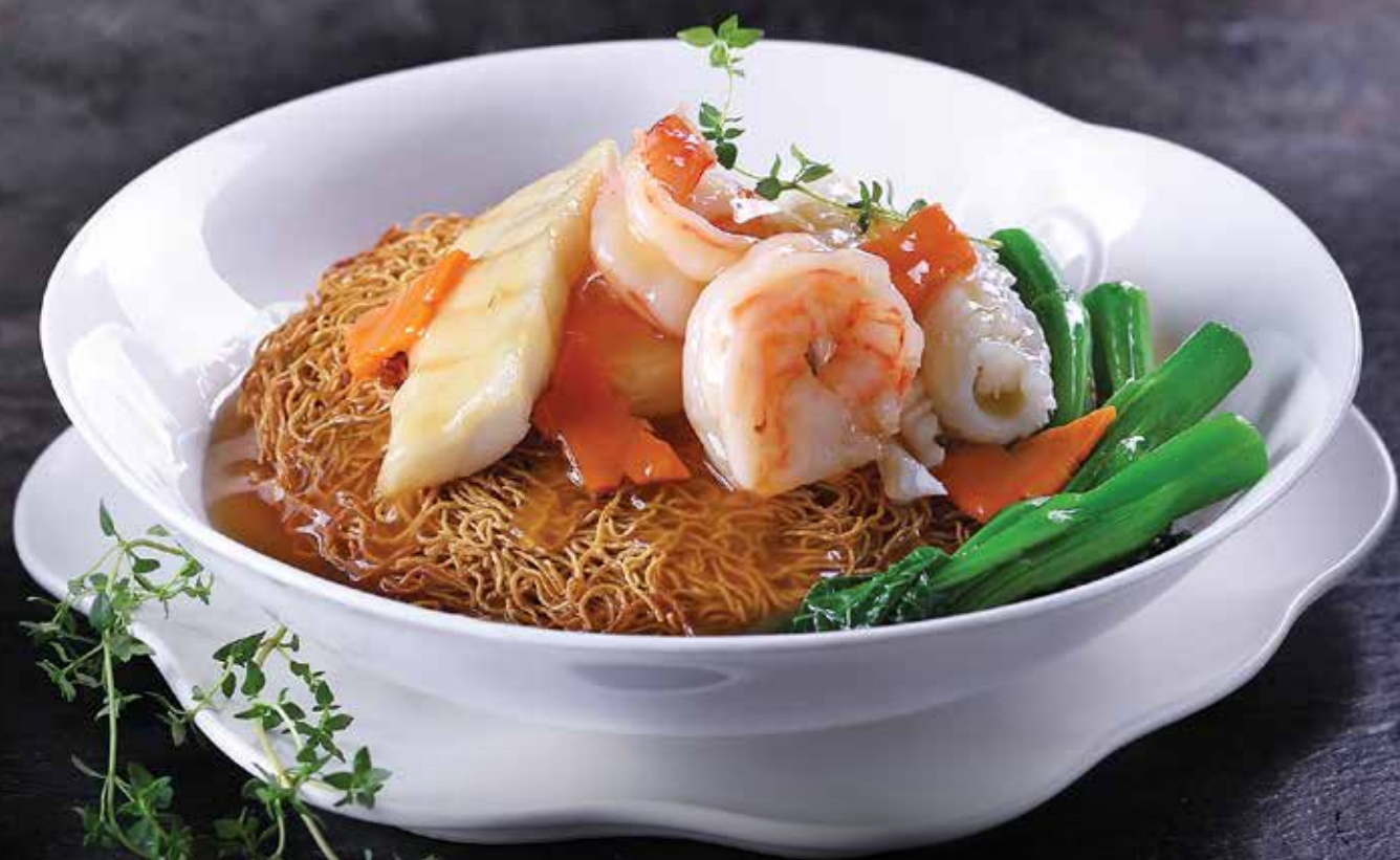
海鲜炒生面 Fried Crispy Noodles with Seafood