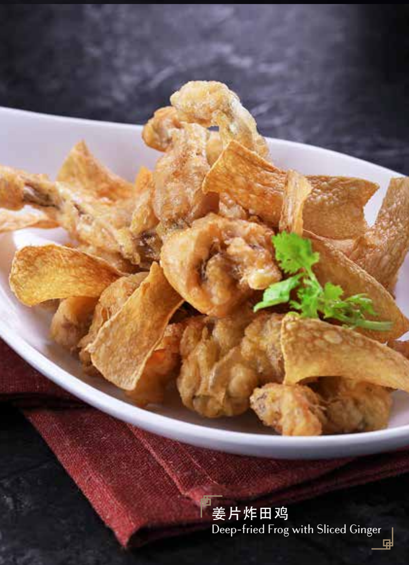
姜片炸田鸡 Deep-fried Frog with Sliced Ginger