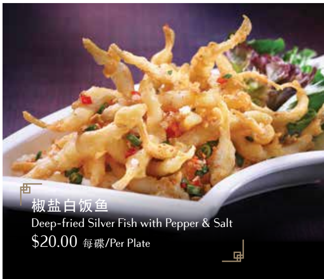
椒盐白饭鱼 Deep-fried Silver Fish with Pepper & Salt $20.00 每碟/Per Plate