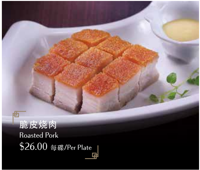
脆皮烧肉 Roasted Pork $26.00 每碟/Per Plate