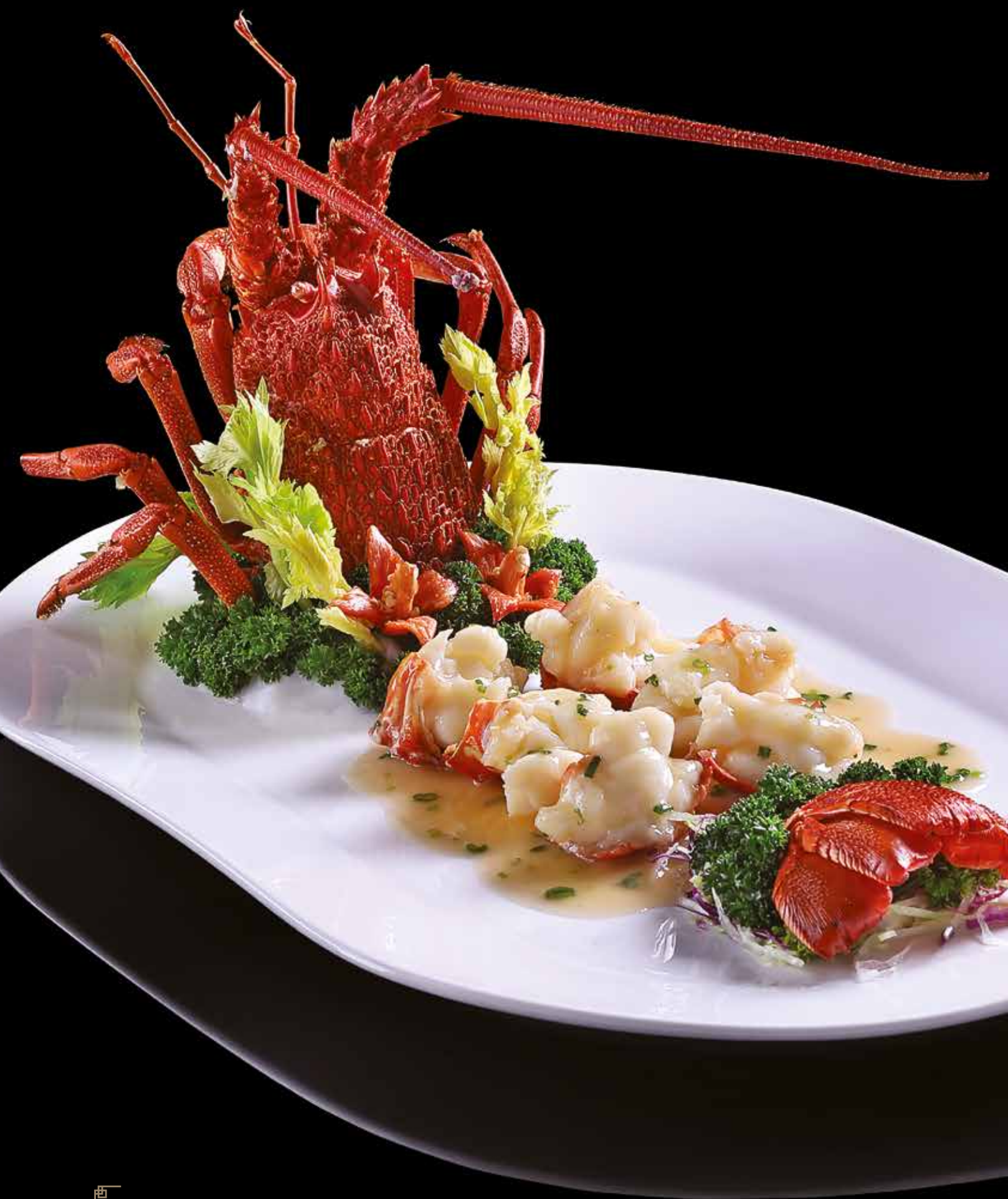
澳洲龙虾 Australian Lobster (上汤焗 Baked with Superior Broth)