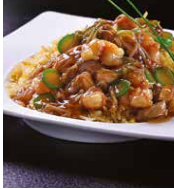
福建炒饭 Fried Rice with Diced Duck Meat, Shrimp & Dried Scallop in Oyster Sauce