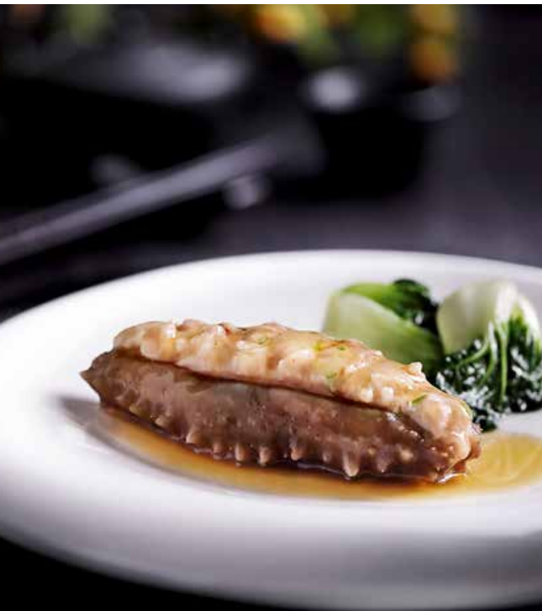
红烧家乡酿原条辽参 Braised Whole Hokkaido Sea Cucumber Stuffed with Minced Pork