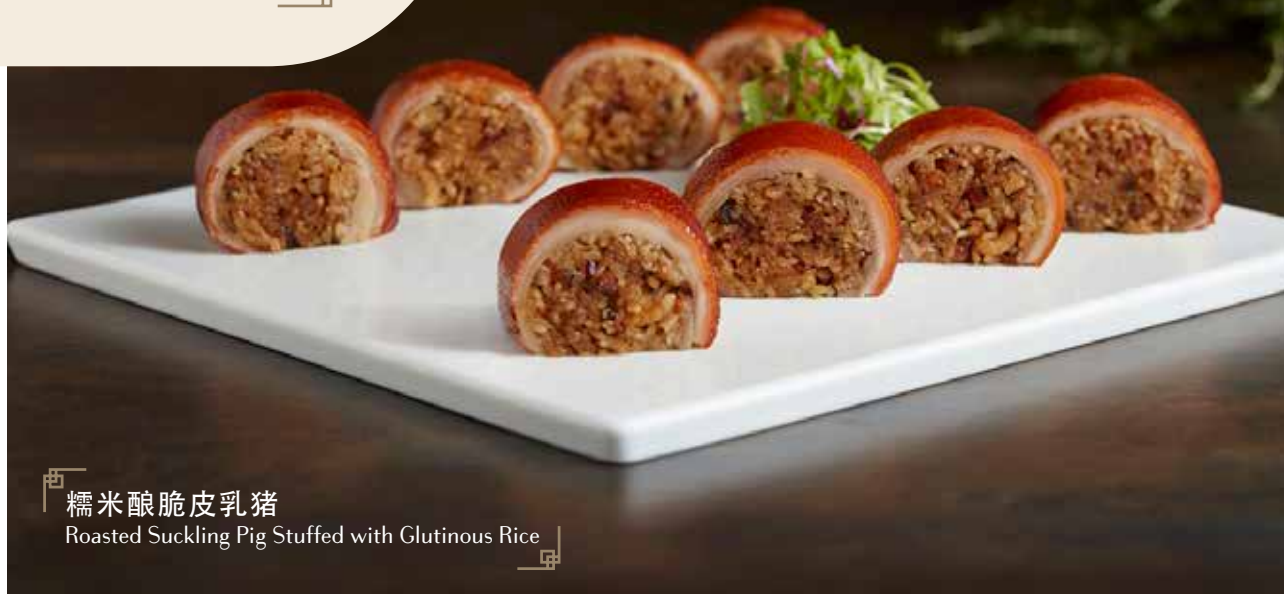
糯米酿脆皮乳猪 Roasted Suckling Pig Stuffed with Glutinous Rice