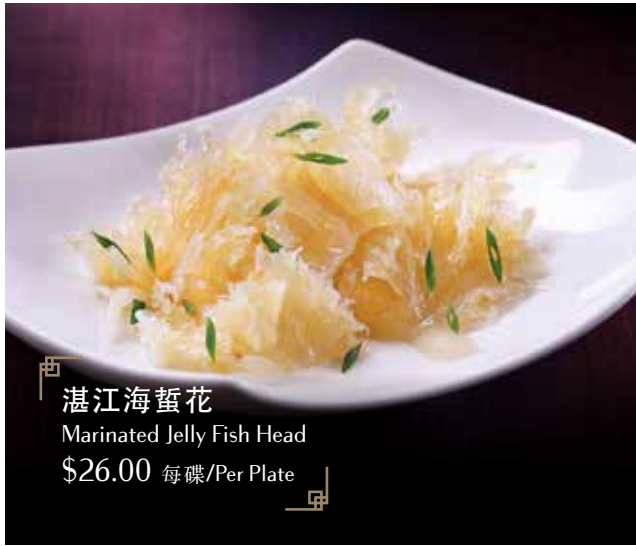
湛江海蜇花 Marinated Jelly Fish Head $26.00 每碟/Per Plate