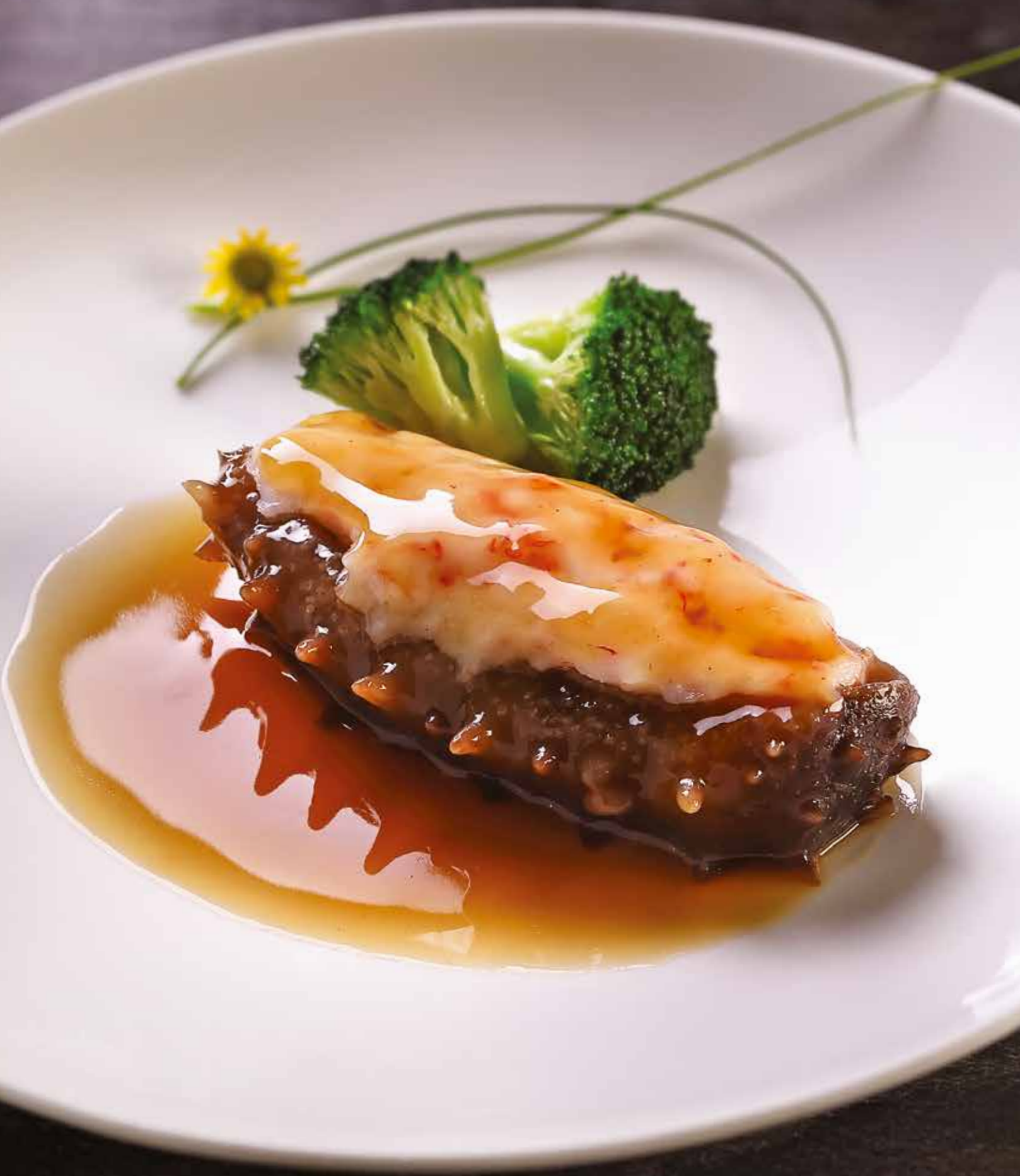
红烧百花酿原条辽参 Braised Whole Hokkaido Sea Cucumber Stuffed with Shrimp Paste