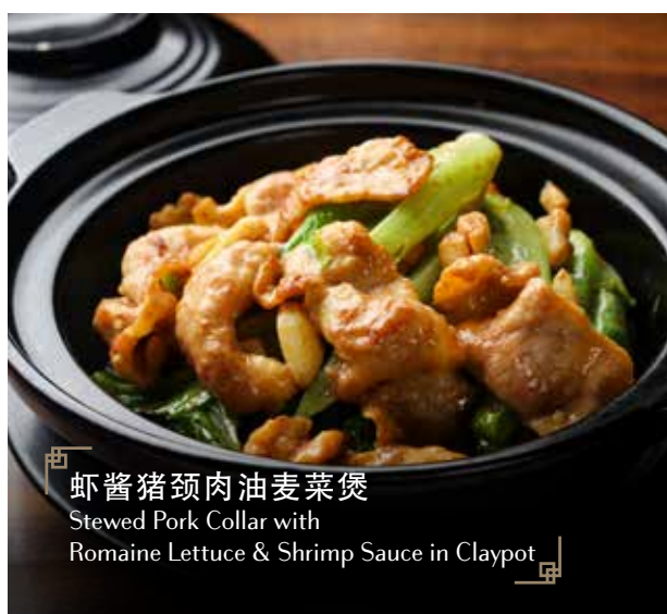
虾酱猪颈肉油麦菜煲 Stewed Pork Collar with Romaine Lettuce & Shrimp Sauce in Claypot