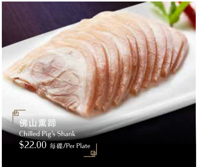
佛山熏蹄 Chilled Pig's Shank $22.00 每碟/Per Plate