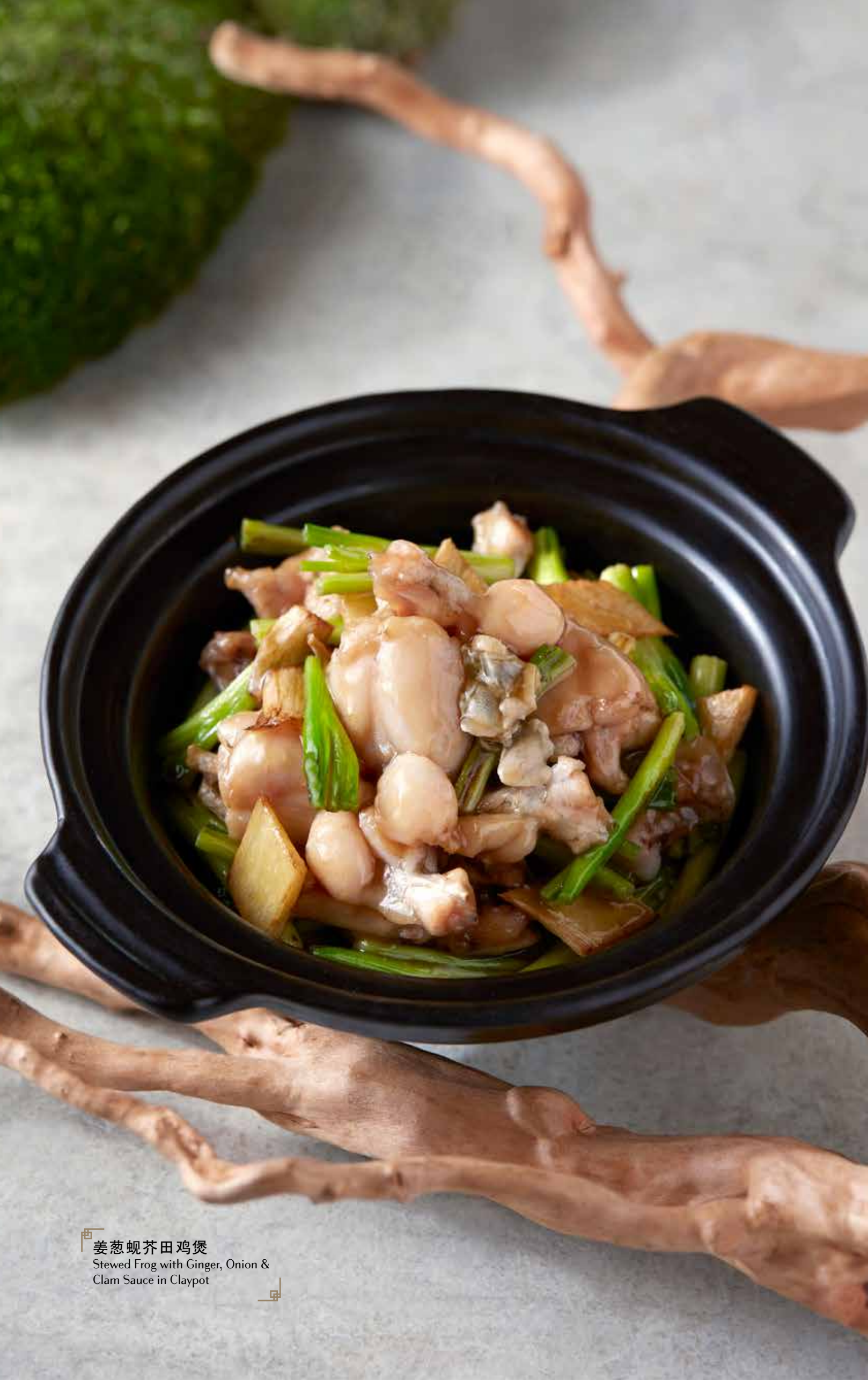
姜葱蚬芥田鸡煲 Stewed Frog with Ginger, Onion & Clam Sauce in Claypot