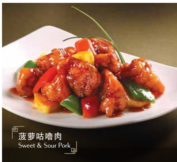
菠萝咕嚕肉 Sweet & Sour Pork