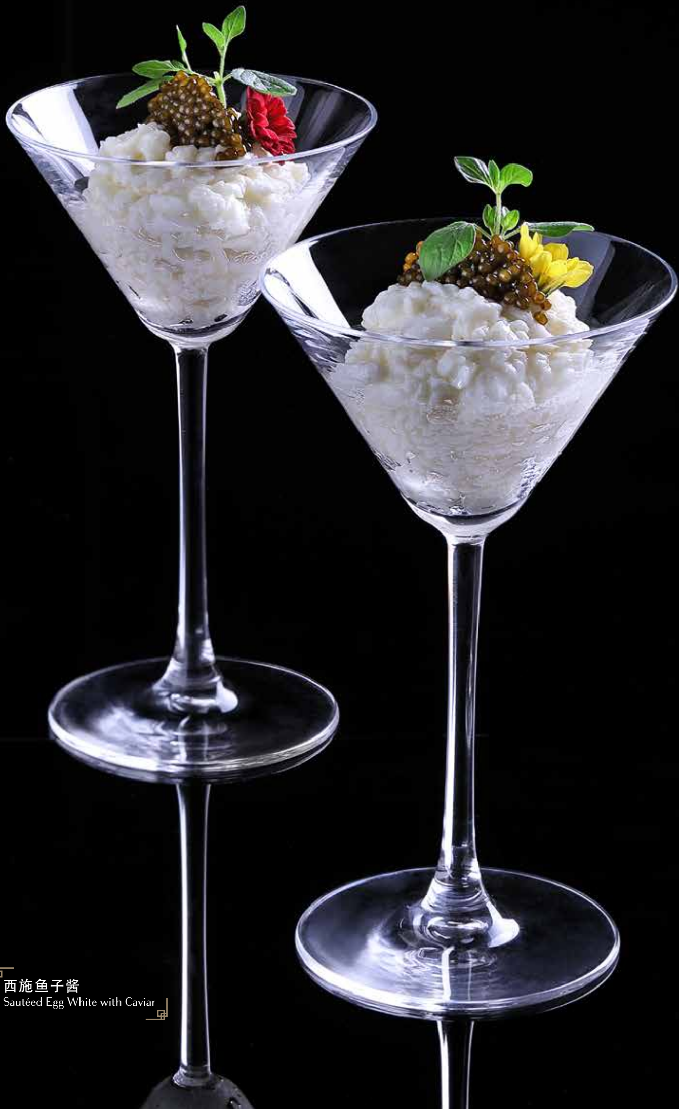
西施鱼子酱 Sautéed Egg White with Caviar