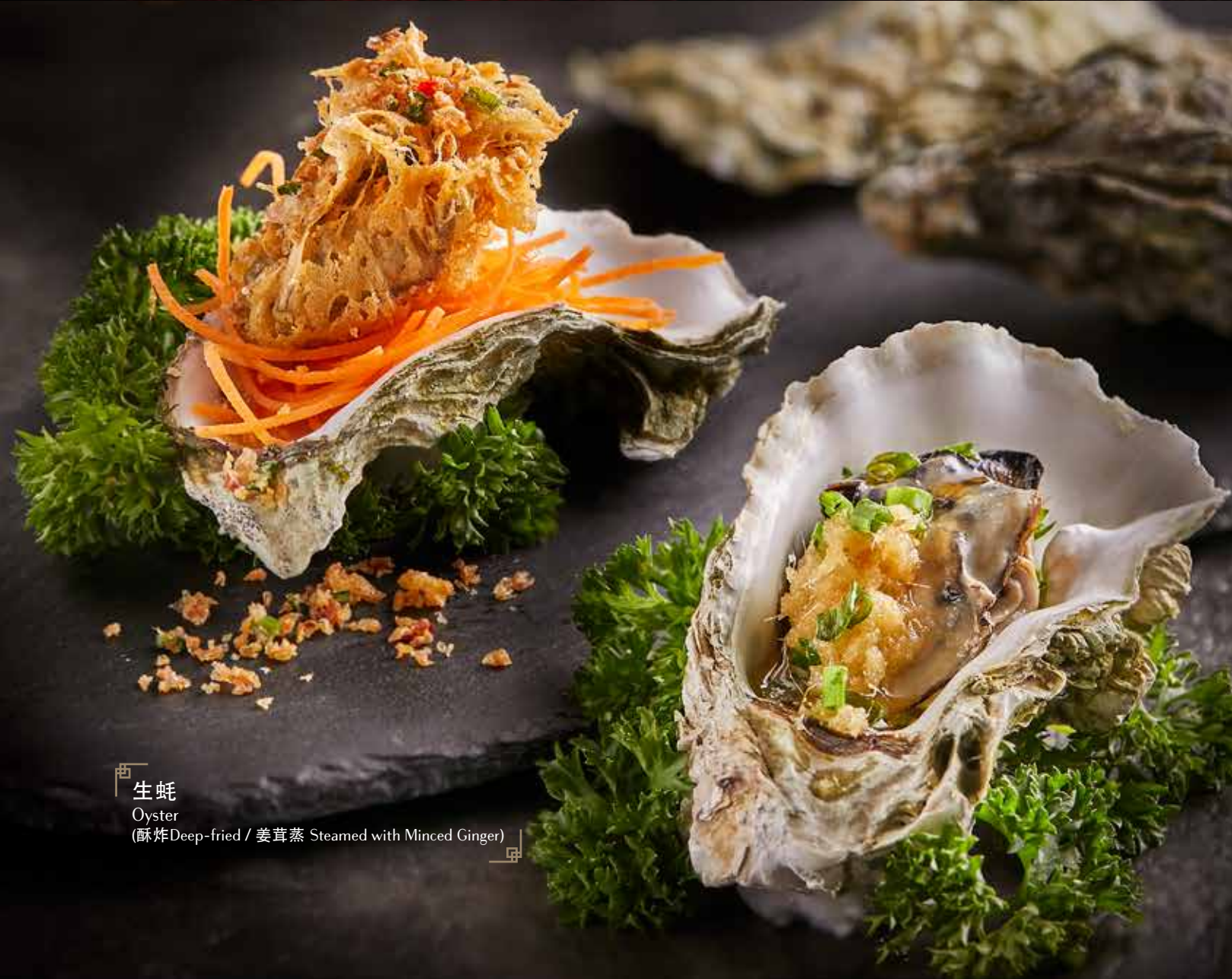
西 生蚝 Oyster (酥炸Deep-fried / 姜茸蒸 Steamed with Minced Ginger)