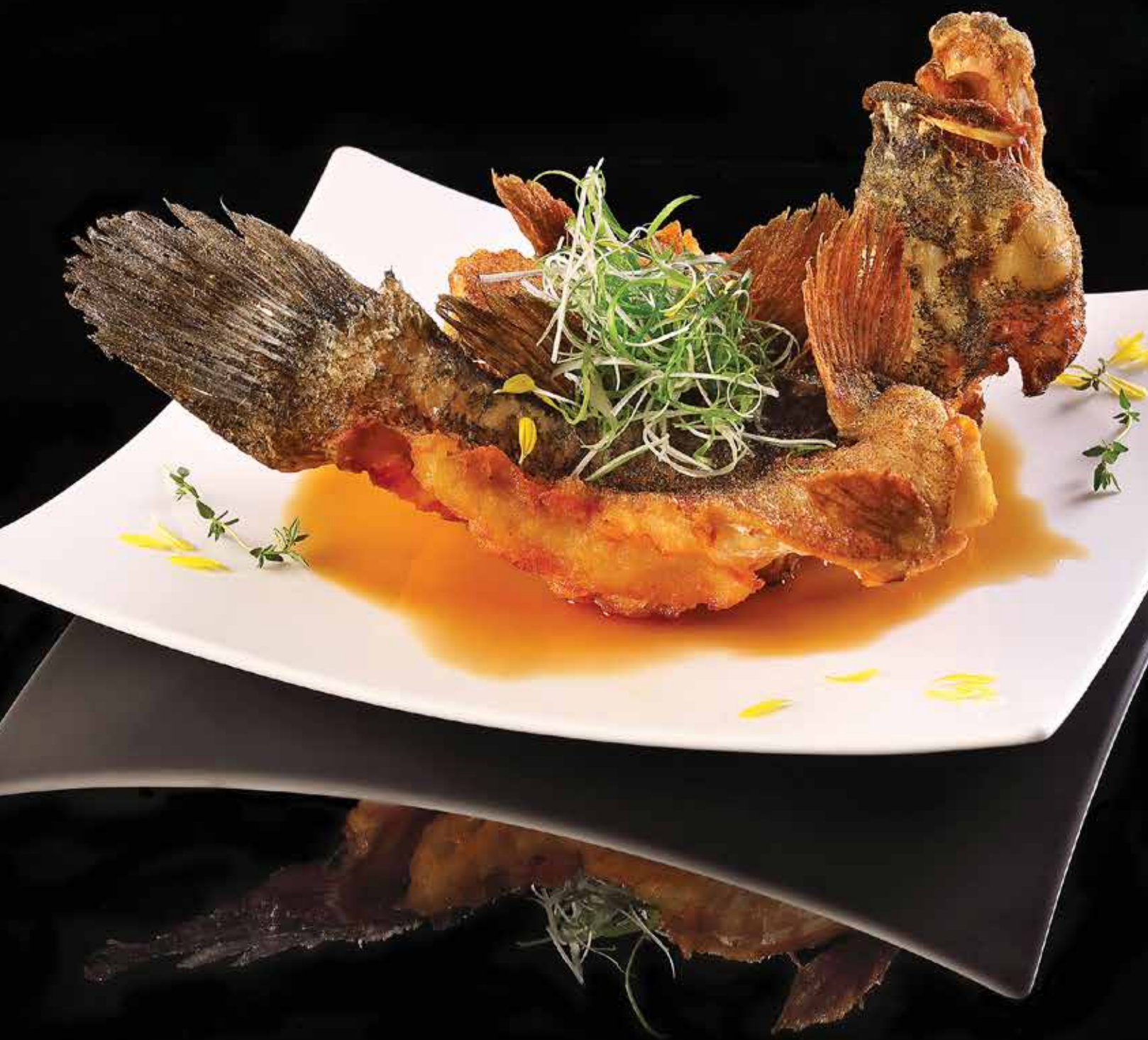
筍壳鱼 Marble Goby 'Soon Hock' Fish (油浸 Deep-fried)