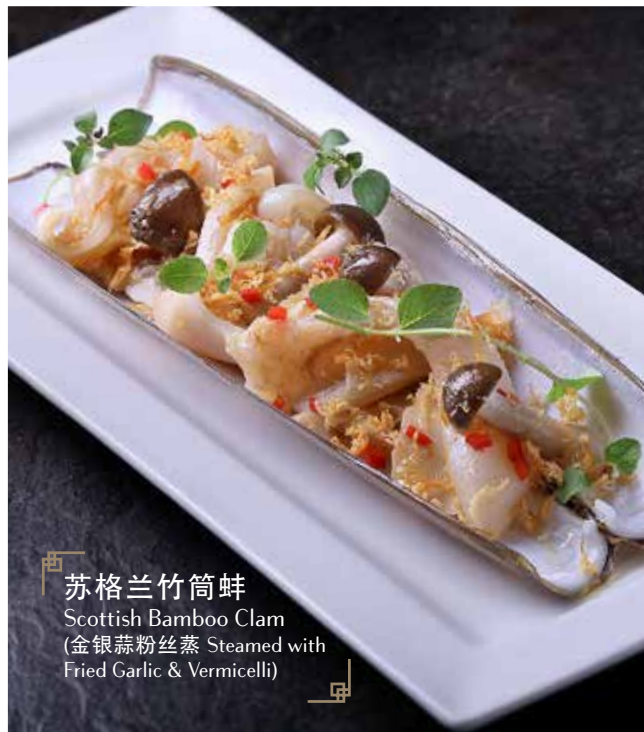
苏格兰竹筒蚌 Scottish Bamboo Clam (金银蒜粉丝蒸 Steamed with Fried Garlic & Vermicelli)