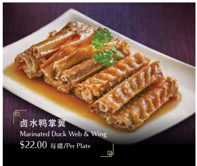
卤水鸭掌翼 Marinated Duck Web & Wing $22.00 每碟/Per Plate