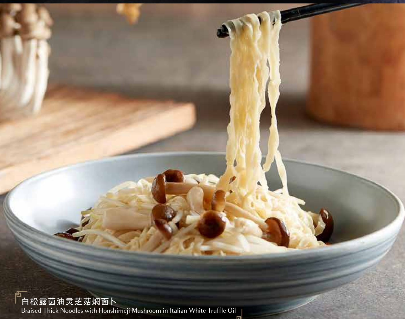
白松露菌油灵芝菇焖面卜 Braised Thick Noodles with Honshimeji Mushroom in Italian White Truffle Oil