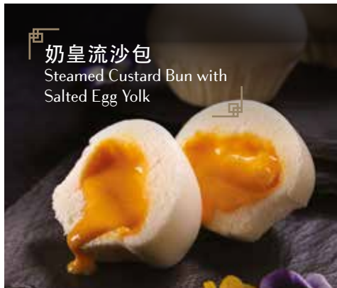
奶皇流沙包 Steamed Custard Bun with Salted Egg Yolk