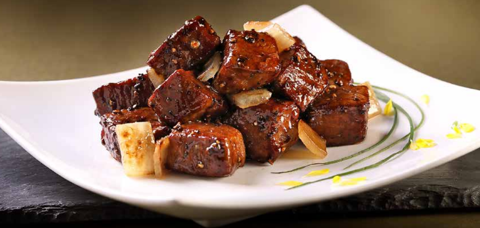
黑椒牛柳粒 Sautéed Diced Beef with Black Pepper