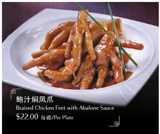
鲍汁焖凤爪 Braised Chicken Feet with Abalone Sauce $22.00 每碟/Per Plate