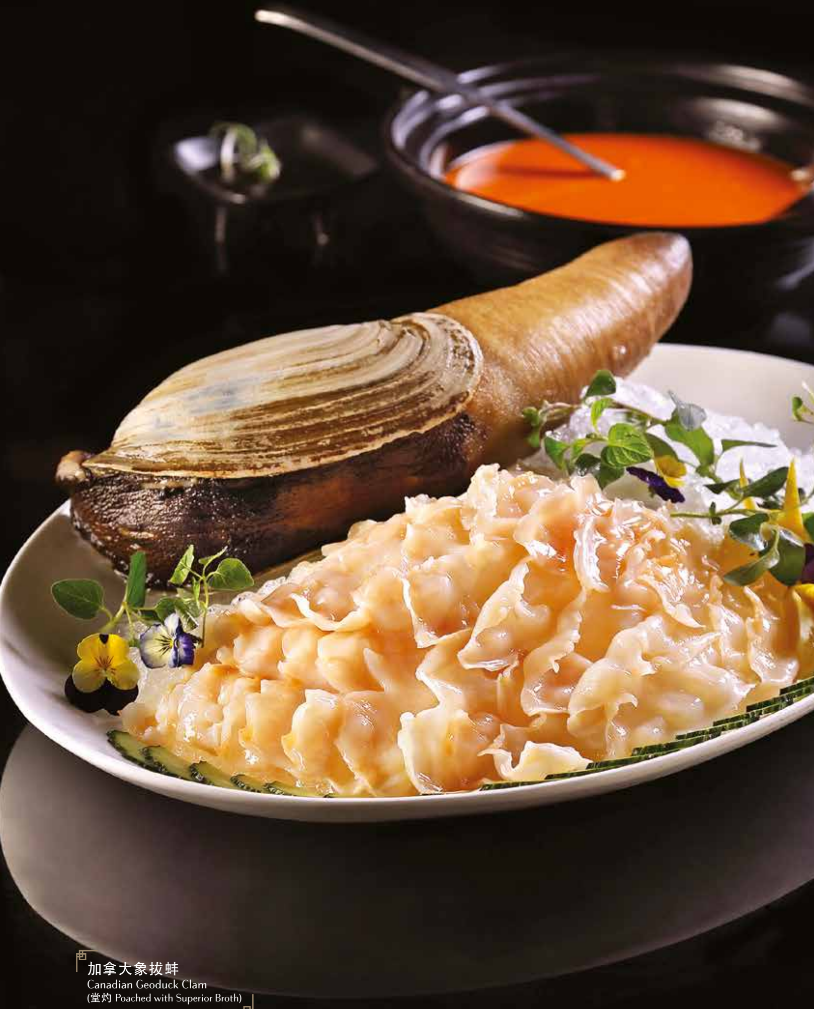
加拿大象拔蚌 Canadian Geoduck Clam (堂灼 Poached with Superior Broth)