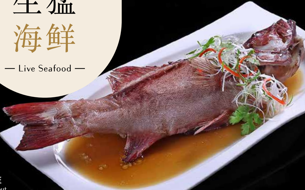
东星斑 Coral Trout (清蒸 Steamed with Superior Soy Sauce)